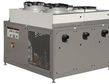
... in an industrial design.