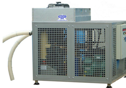
... in an industrial design.