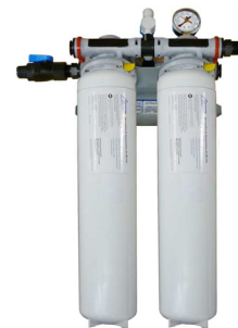
Cartridge waterfilter 180-2

Technical details: please see respective machine specification. With pleasure we submit to you any further information, also regarding your special requirements