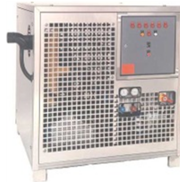
... in an industrial design.