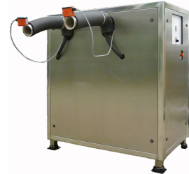
Ice maker with control system and stainless steel cabinet...