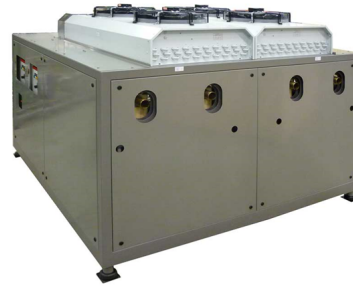
... in an industrial design.