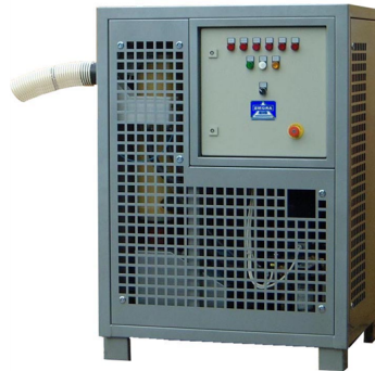
... in an industrial design.