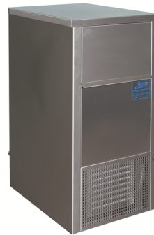
...in a sturdy stainless steel cabinet